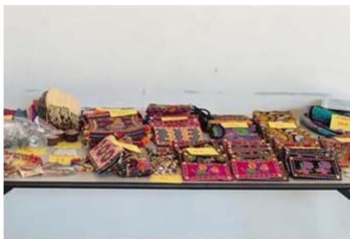
In the photos above, Silvia in charge of the Indian item stall to raise funds for the foundation.