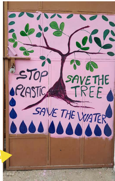
Wall painting on the school gate based on the poster.