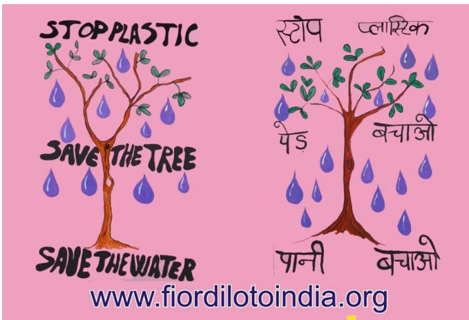
Sticker made from the poster.